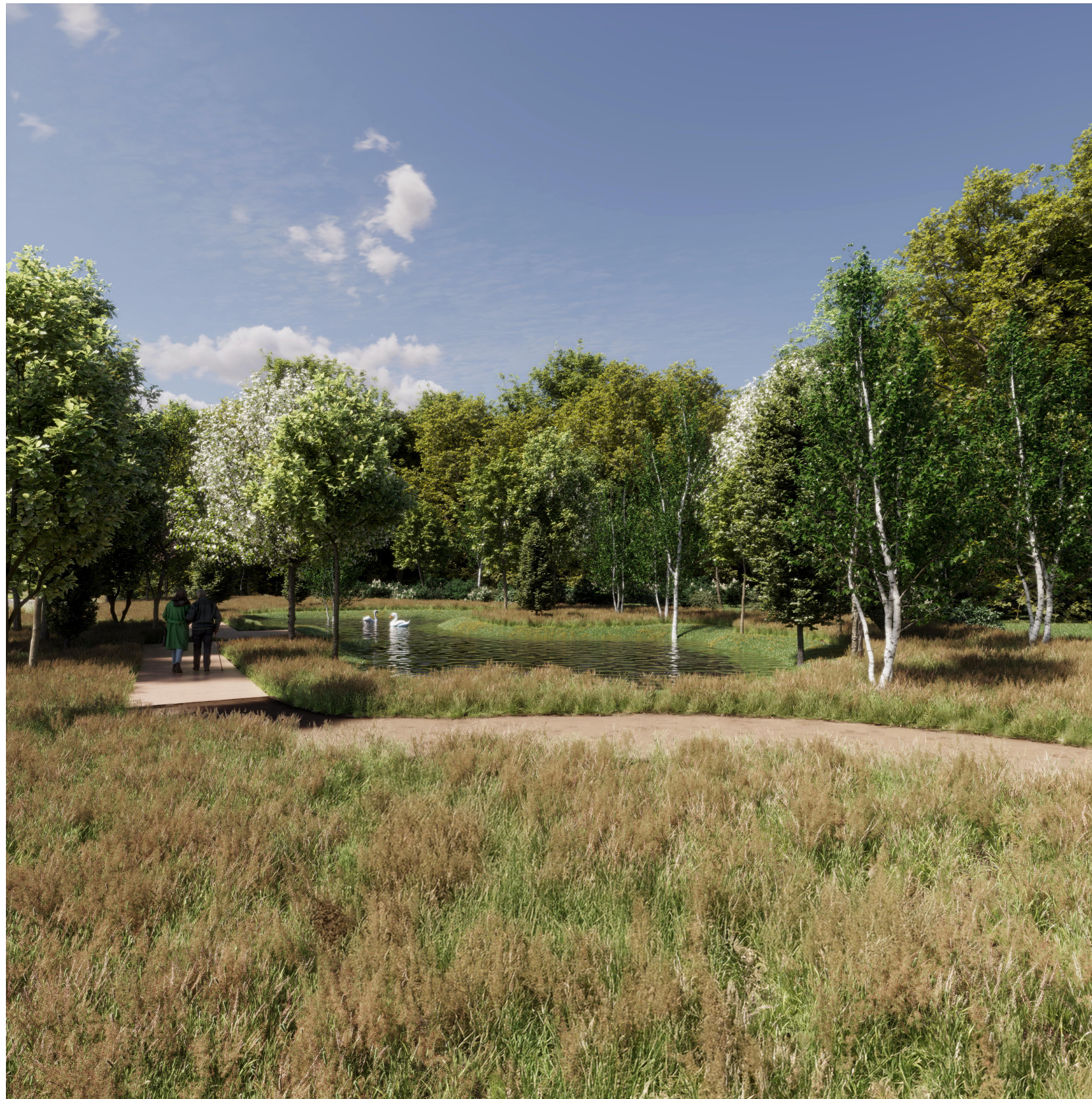
Public Realm Wetland Feature

COPYRIGHT: The design and details shown on this drawing are applicable to The Named Project only and may not be; reproduced, modified or relayed in whole or part or be used for any other project or purpose without the prior written permission of TOT Architects with whom copyright resides. DO NOT SCALE this drawing. Use figured dimensions only. The Contractor is responsible for checking all levels and dimensions on site prior to commencement of works. Any discrepancies are to be referred to the ARCHITECT. Drawings to be read in conjunction with all other Consultants Drawings & Specifications were relevant. Proprietary items shall be fixed in strict accordance with the Manufacturer's Instructions. Sizes of proprietary items shall be checked with Manufacturer.